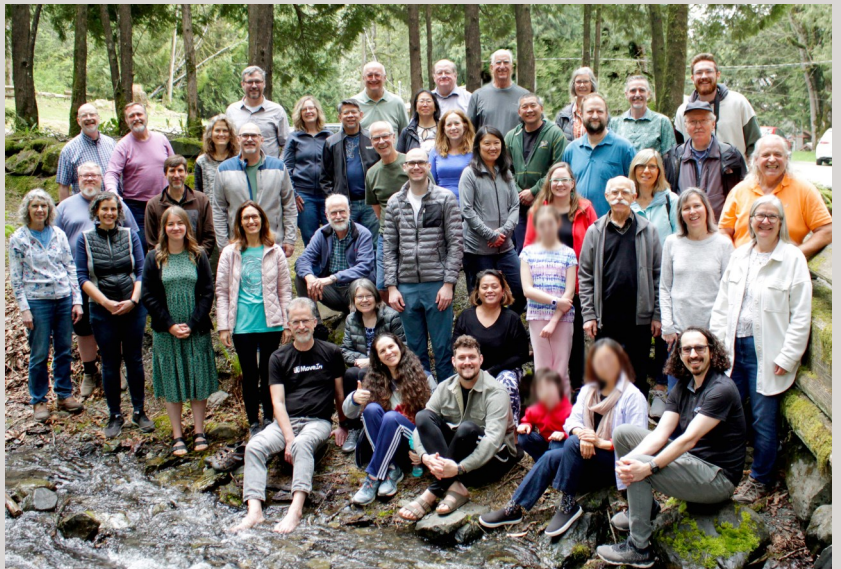
Some of the OC team at our Spring 2023 Staff Retreat